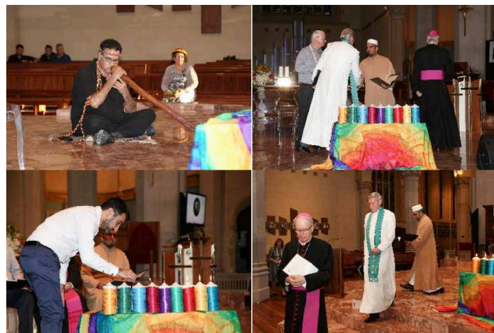
A moving inter-faith service hosted at St Mary's Cathedral to reflect the commencement of the ASBA 2015 Conference

We were appointed PCO for the Australian School Bursars Association Conference in 2012. ASBA has over 1300 members working in Non-Government Schools across Australia and New Zealand. ASBA initially expected to attract up to 600 delegates – school and college business managers and decision makers on school resources.